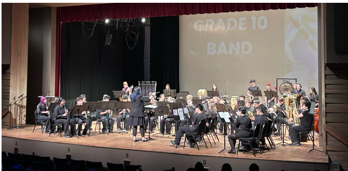
Year-end Band Concert