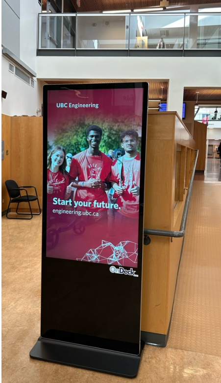
A new electronic sign board with post-secondary info.