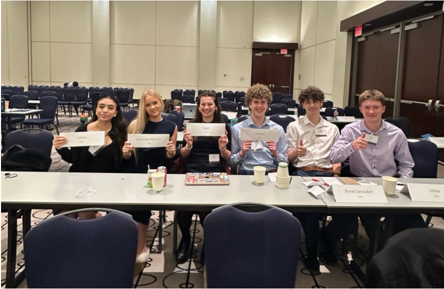
Carson students attending the Vancouver Model UN at the Hyatt last weekend. (above & right)