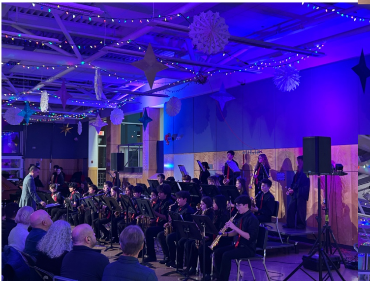
Winter Jazz Concert