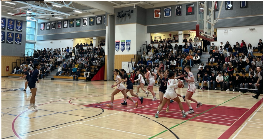
No Regrets Basketball Tournament