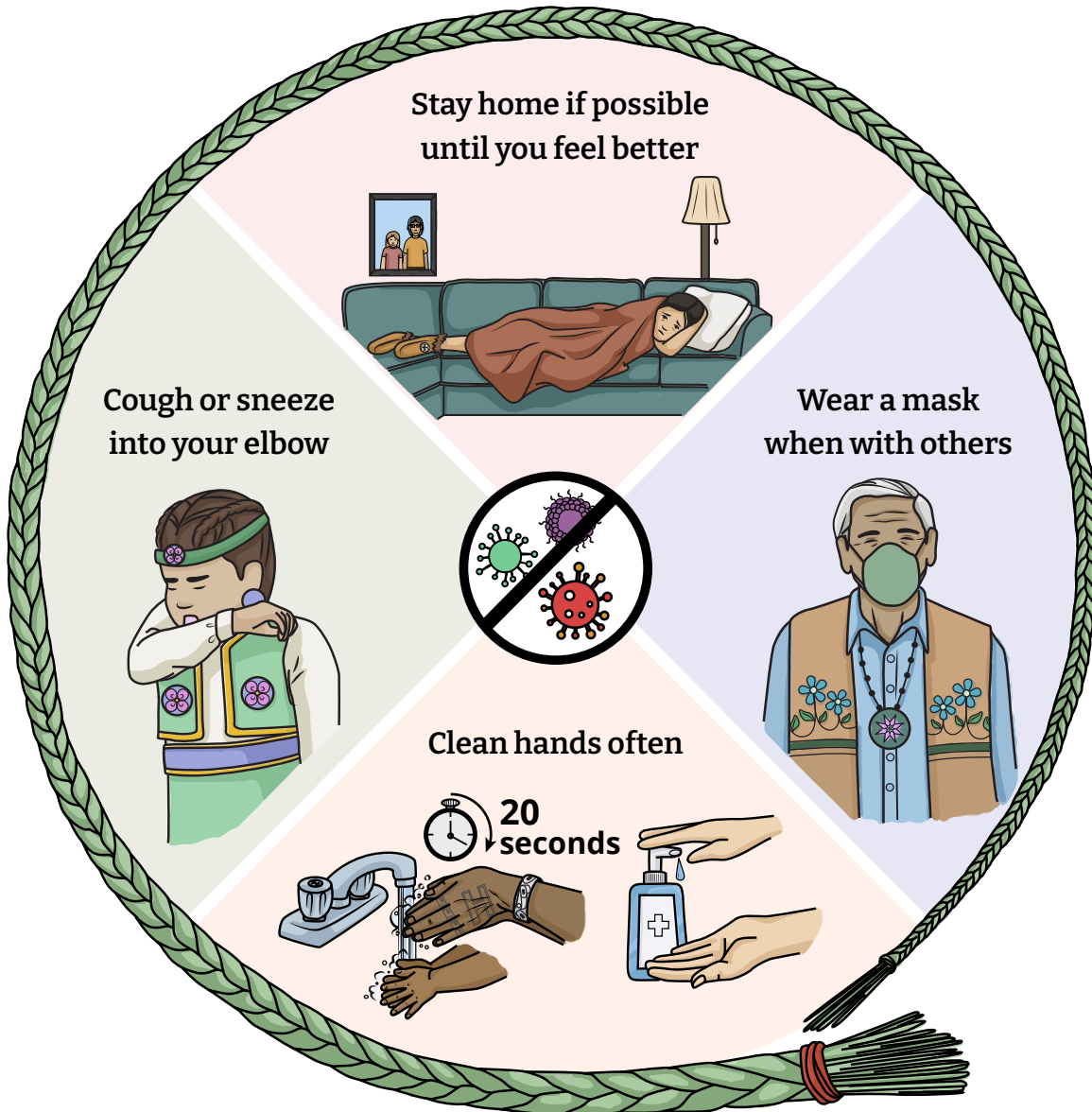
Illustration: Shoshannah Greene

Lots of people are getting sick this season. It could be a cold, the flu, or COVID-19. If you're not feeling well – no matter what virus you have – help stop the spread.