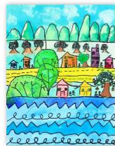
Canvases & aluminum panels