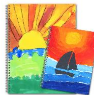
Notebooks & sketchbooks