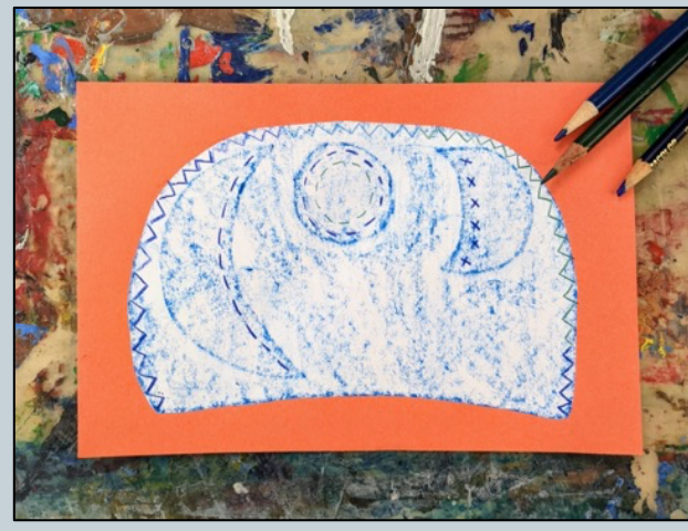
Draw hand stitching using dark pencil crayons