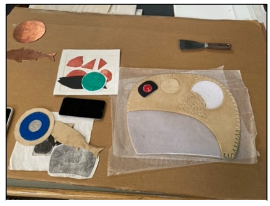
Materials used by Vickers to create plate for printing