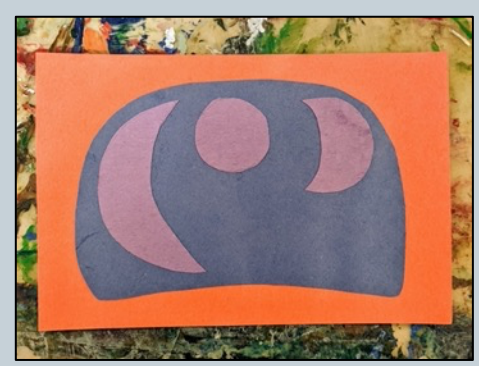
The rubbing is glued on one side of a 9 " x 6" sheet of construction paper and the original ovoid composition is glued on the other side