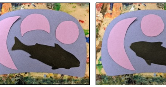
Different possible ways of arranging the moons and salmon

• Discuss Charlene's use of the ovoid in her print. Have students observe and point out the ovoid shapes she used.