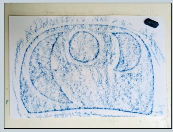
Rubbing created using construction paper composition and blue oil pastel