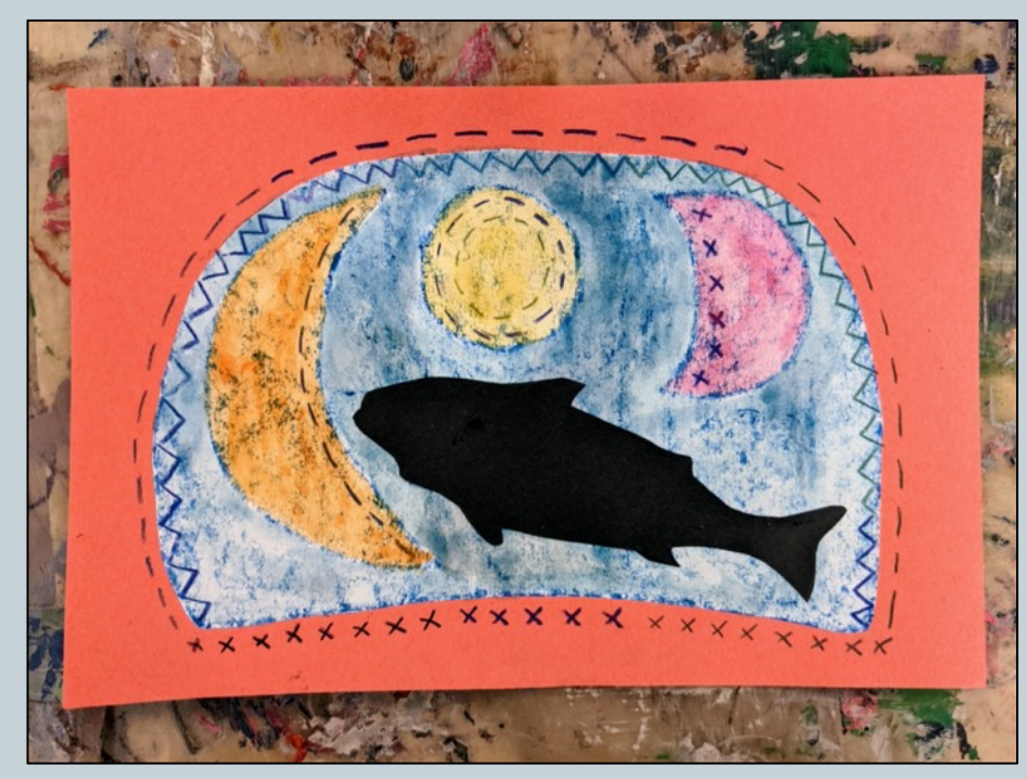
Completed teacher sample with moons and space around them painted with a transparent layer of watercolour paint