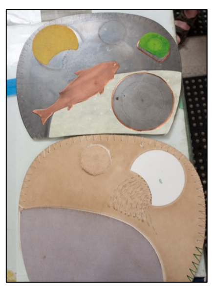
Printing plate and other materials

LESSON #3 (drawing and painting details and gluing salmon stencil):