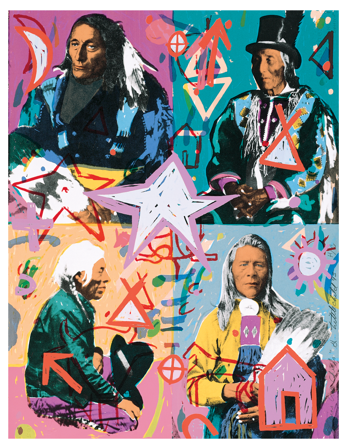
George Littlechild, Plains Cree Chief , 1996, 17 colour serigraph, 29 x 22.5 inches. Image courtesy of the artist.