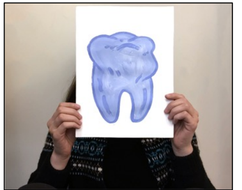
Example of photograph taken holding one of the 6" x 6" personal symbols created in Lesson #2.

• Have students discuss the use of symbolism and colour in art by posing the following questions: What is a symbol? Why might artists use symbols in their artwork? How can colour be used to