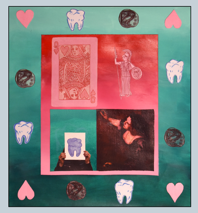
Teacher sample of finished collage.