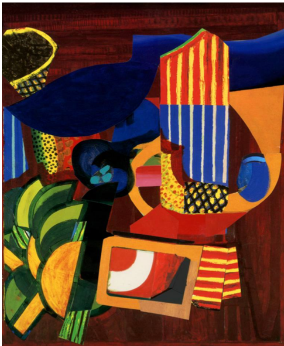
Tiko Kerr, Three Musicians , paper collage, 10.3 x 9 inches.

After students complete their collages in Lesson #3, have them reflect on the following questions: How can I use oil pastels to blend, overlap, and create patterns in the creation of an abstract design? What techniques do artists use to select and recombine images?