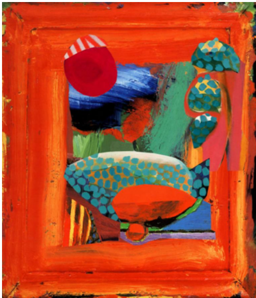
Tiko Kerr, Fish Tank , paper collage, 5.3 x 4 inches.