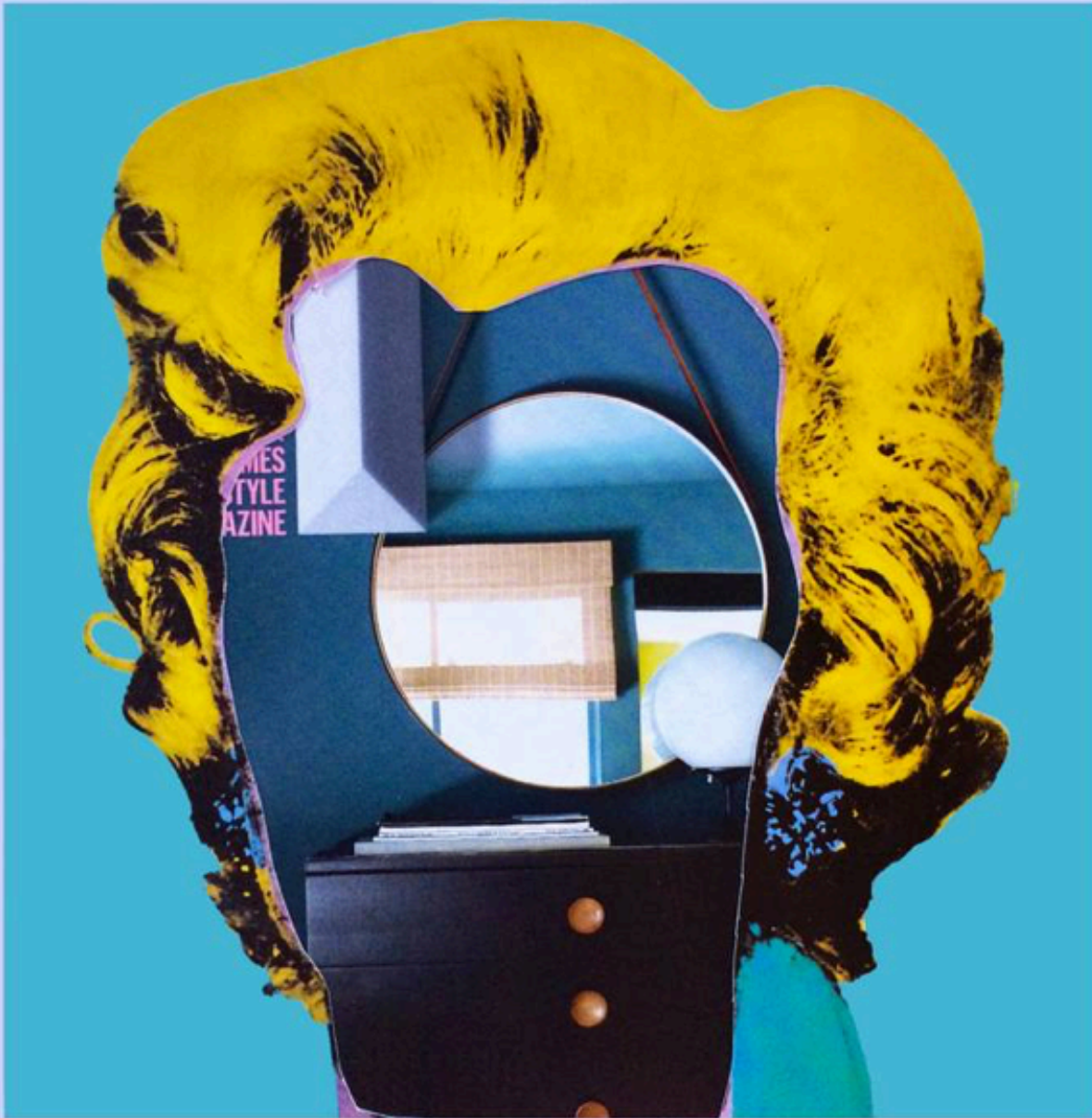
Tiko Kerr, Mid Century Modern (after Warhol) , paper cut collage, 9 x 9 inches framed.