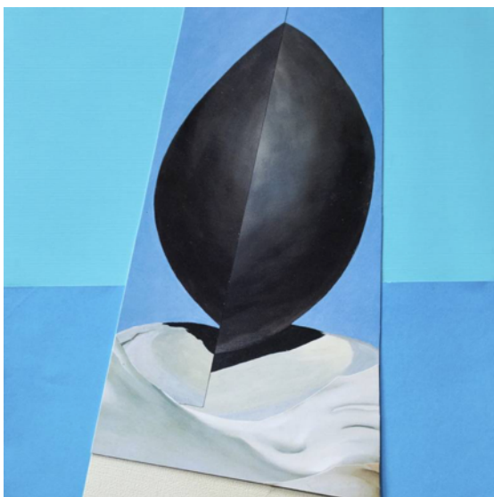
Tiko Kerr, An Elegant Departure , paper cut collage, 12 x 12 inches.

LESSON #1 (intro to Tiko Kerr and stencilled face creation):