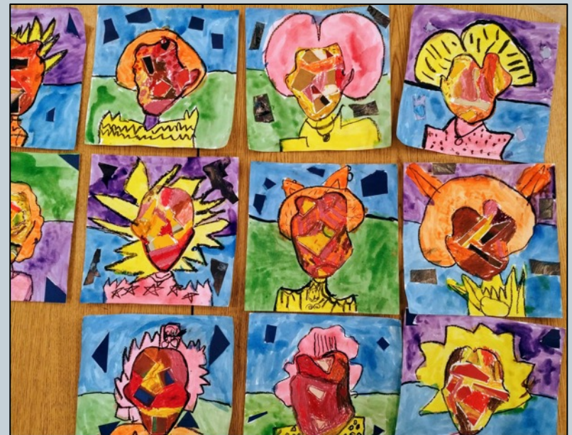
Artworks by Kindergarten Students at Dorothy Lynas Elementary, AFK Outreach Program