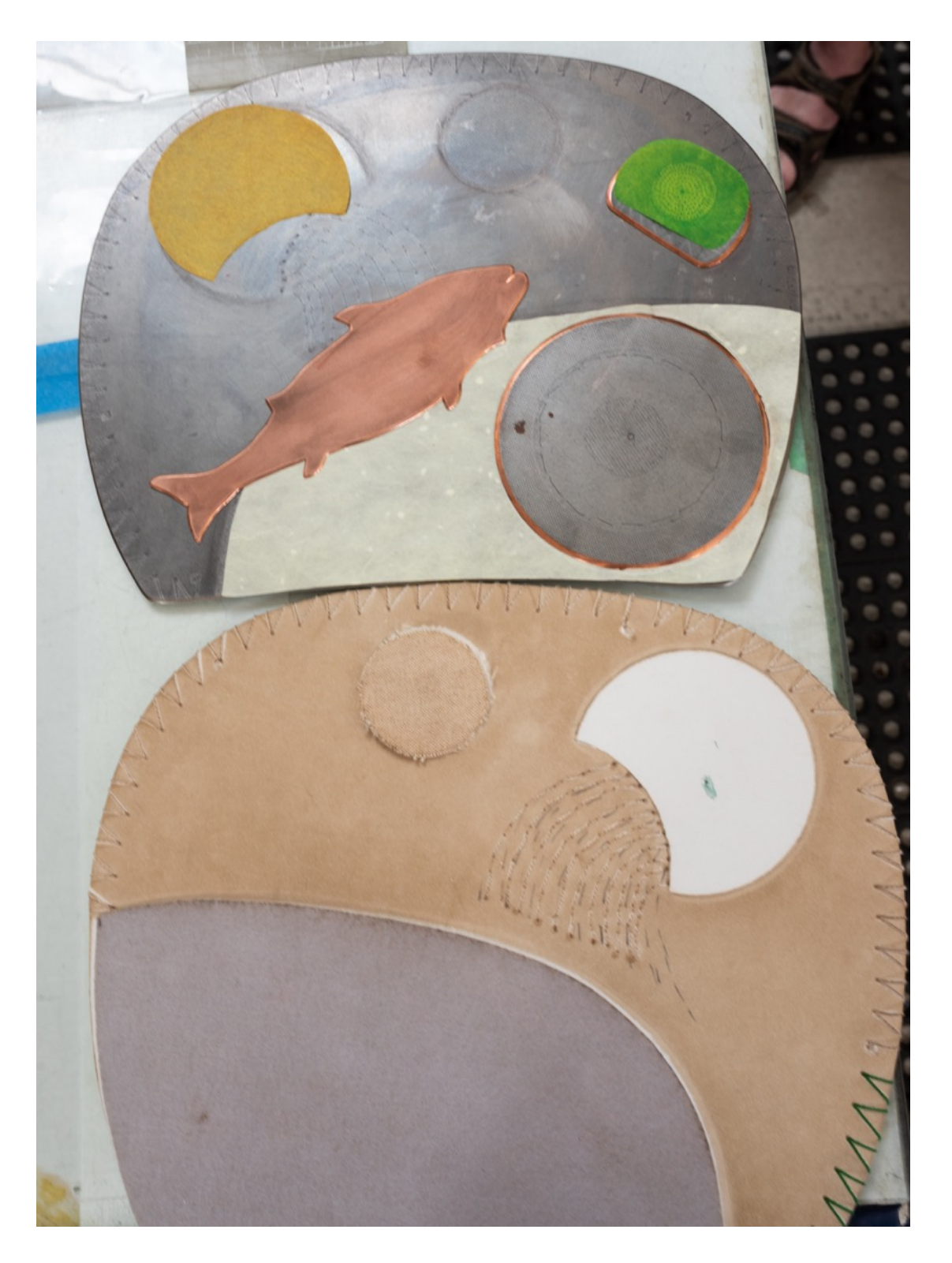
Printing plate and other materials