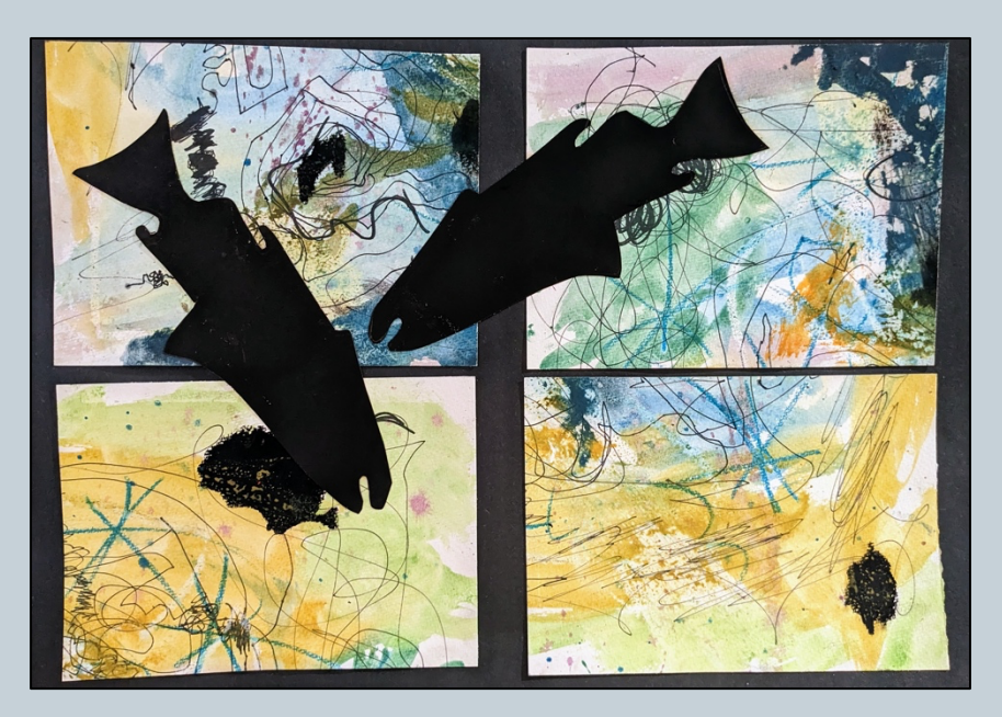
Completed student artwork