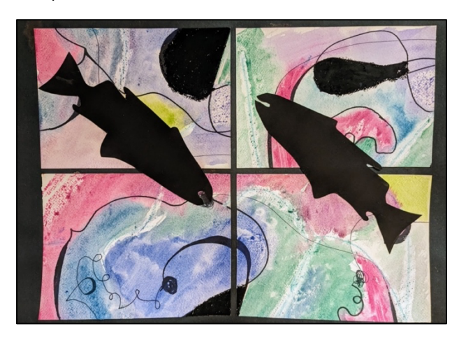
Completed student artwork