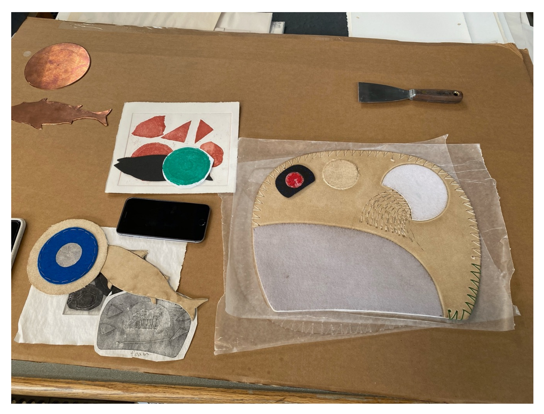
Materials used by Vickers to create plate for printing