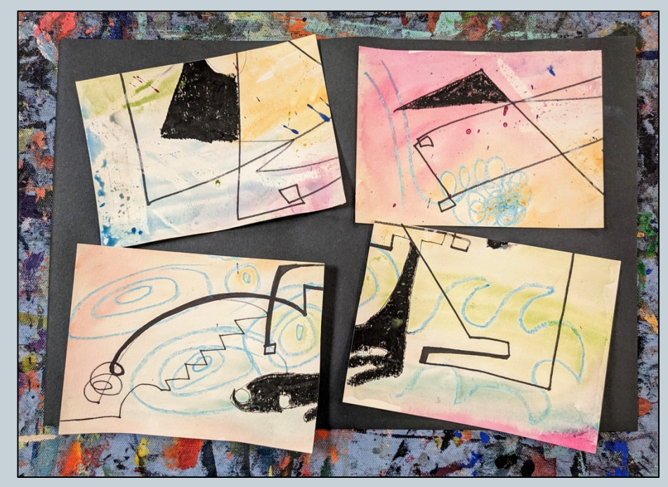
Teacher sample showing paths drawn with thick and thin sharpies. Parts of the lines have been thickened and 3 closed shapes have been filled in with black oil pastel. Blue pastels have also been used to draw the path of water.