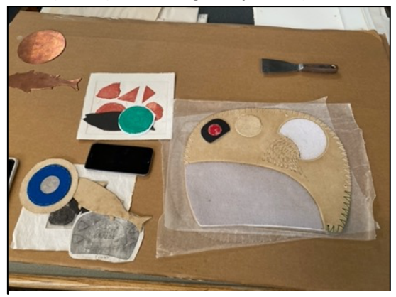
Materials used by Vickers to create plate for printing

draw an additional path (i.e. the path of their favourite character in a book) overlapping on top of the first.