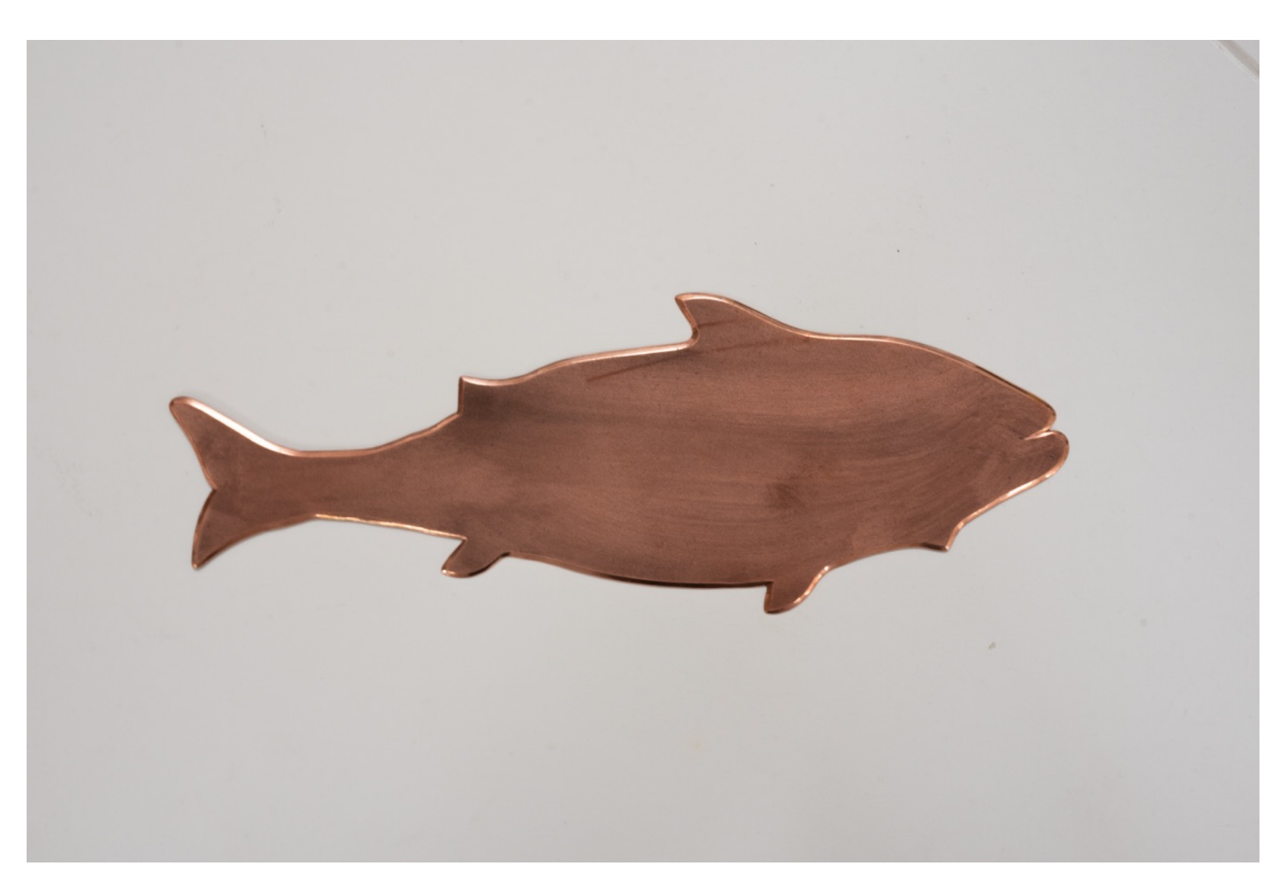
Fish silhouette used for Vickers' print