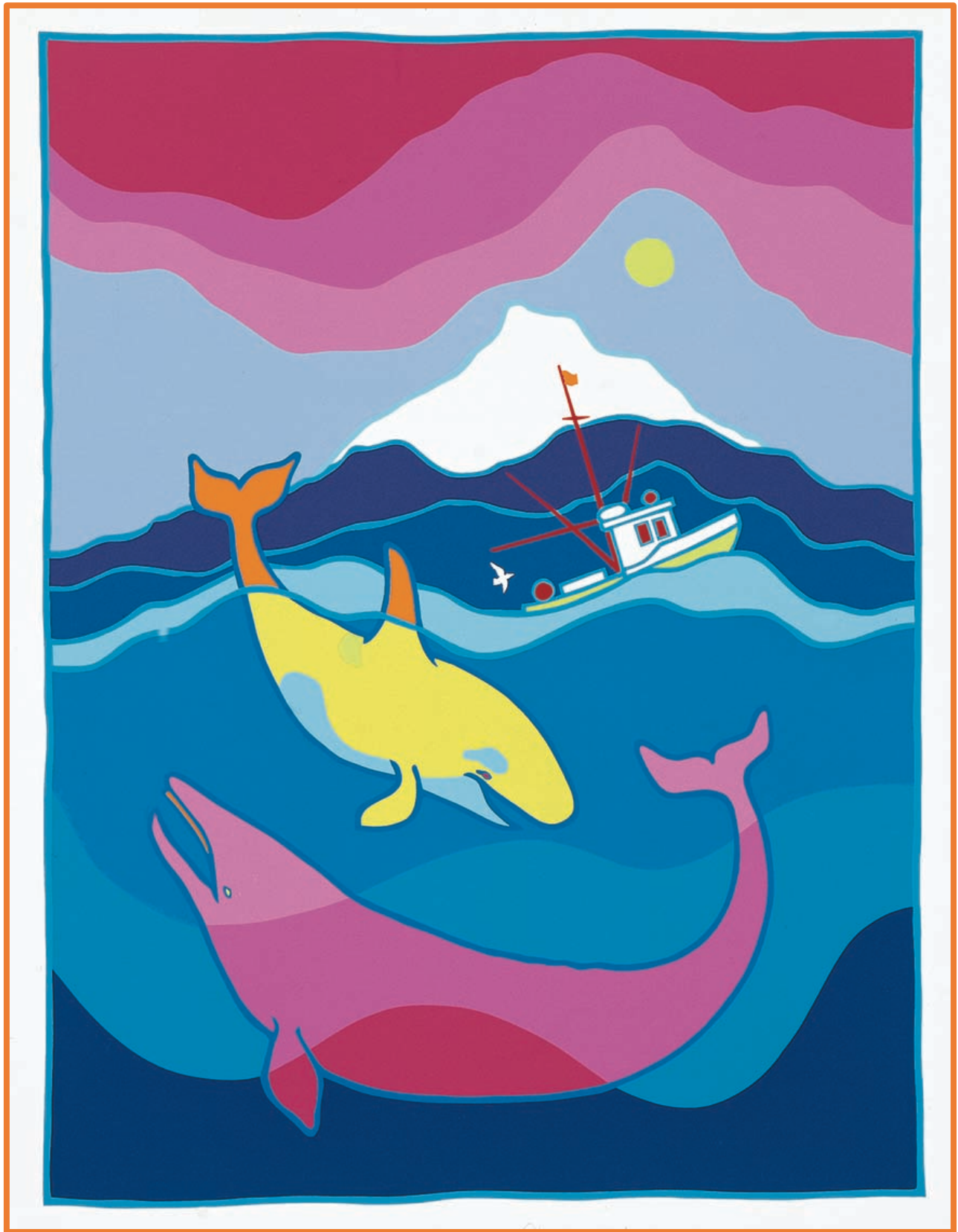
Ted Harrison, Whale Frolic , 1994, colour serigraph, 24" x 18"