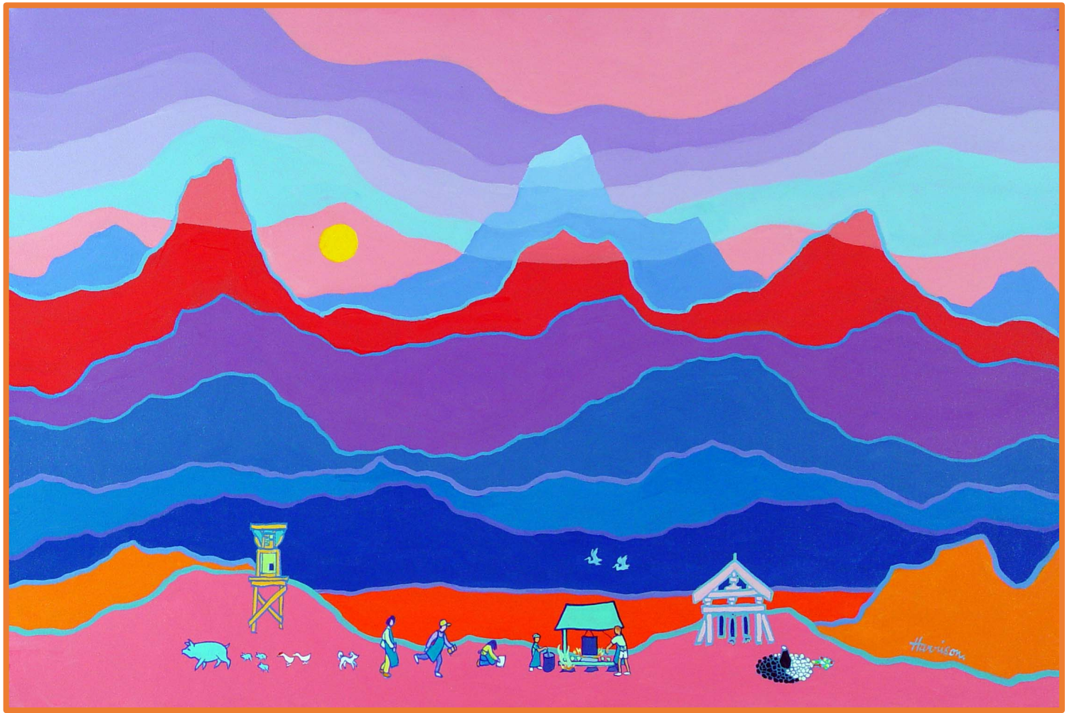
Ted Harrison, Paradise Visions , 2010, twenty six colour serigraph, 22.5" x 30"