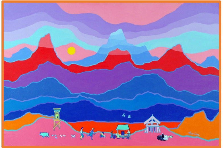
Ted Harrison, Paradise Visions , 2010, twenty six colour serigraph, 22.5" x 30"

which drew inspiration from the landscapes and culture of the Yukon. His artwork is characterized by bold, flowing lines and vivid, non-traditional colors, creating whimsical and dreamlike interpretations of northern scenery. Harrison often used simple shapes, layers, and playful compositions to depict mountains, rivers, and skies, blending abstraction with representational art. His work conveys a sense of movement and energy, capturing the spirit of the North. Harrison's style is instantly recognizable and has made a lasting impact on Canadian art.