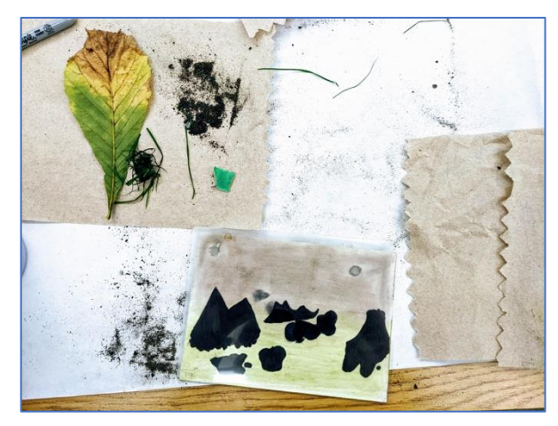
Self-guided tours run for 2.5 hours and are available on various dates from November 2022 to February 2023. You can book your class <u>HERE</u>.

The cost of the tour is covered by the School District for all NVSD classes.