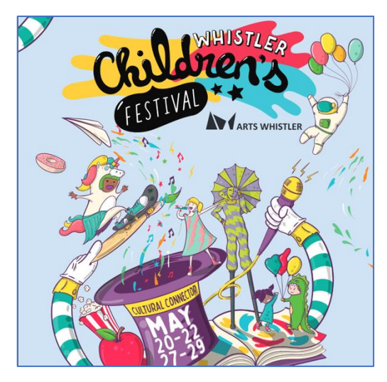
the full festival schedule HERE

After two years of running the festival online, the Whistler Children's Festival is back in person over the last two weekends in May (20-22 & 27-29).