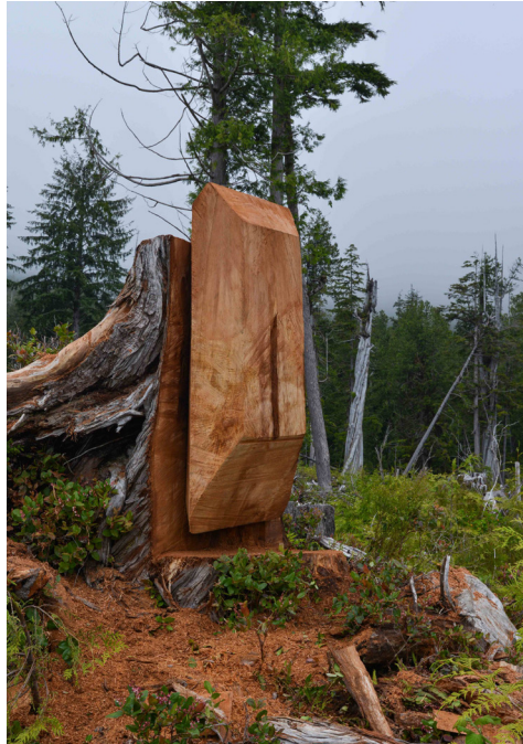
Cameron Kerr Grid and Nature , 2020 inkjet on cotton paper 40" x 50"

Prevailing Landscapes is an exploration into the iconic Canadian Landscape; it has been the central theme to our country's visual artworks since the 19th century, and it remains a critical theme in countless works today. The landscape is one element in our country's framework that holds few social, ethnic, cultural, gender specific boundaries. It is physically vast and offers a visual backdrop for art throughout different periods and genres. Historically we have engaged with the Canadian landscape through the male gaze - a romanticized colonial perspective of the great Canadian wilderness, but how has that perspective changed in contemporary conceptual art works and how have the landscapes added to the narratives of these works?