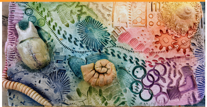
The Clay Kit was launched providing educators with the tools to bring clay into their classrooms.