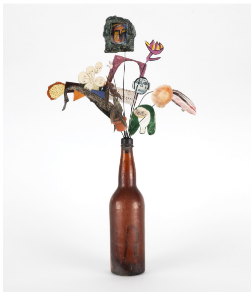
Geoffrey Farmer , Bouquet , 2023 paper, wire, found bottle from the 1940's, 61 x 38.1 x 25.4 cm Gift of the artist