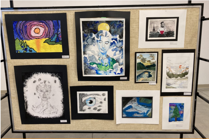
Over 375 students exhibited their work at the Art from 44 District Art Show