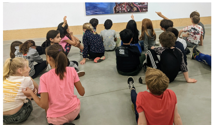
Students in grades K-12 visited the Prevailing Landscapes exhibition during the Spring Gallery Program

Number of students visiting the gallery: 800