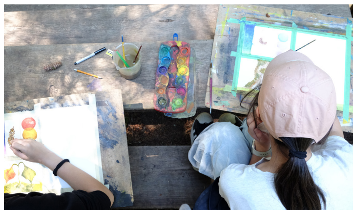
Creating art and memories at summer camp.