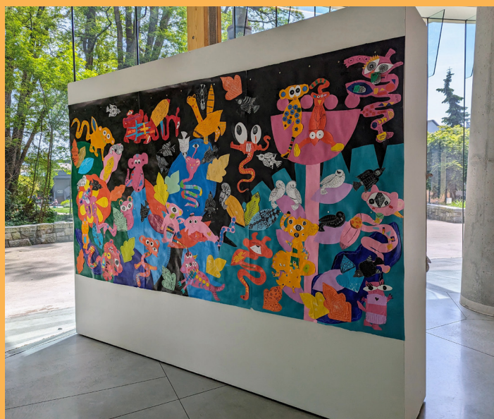
Individual artworks were combined to create a mural that was displayed in the lobby of the Gordon Smith Gallery.