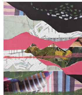
Example of artmaking activity

K-12 classes were invited to visit the Gallery where Artists for Kids art educators led classes in a half-day interactive tour of the spring exhibition, Prevailing Landscapes , and a hands-on artmaking activity. Through the artmaking activity, students created collaged landscapes inspired by the work of artist Krystle Silverfox.