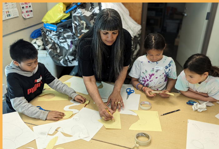
Grade 3 students learned techniques for drawing and painting animals and foliage.

Johal has worked on a number of notable site-specific commissions including a recent mural for the Vancouver Art Gallery's inaugural #SpotlightVanArtRental project (2021), a digital projection mapping for Facade Festival produced by Burrard Arts Foundation (2019), and a 4,000 sf collaborative mural project for Vancouver Mural Festival, which centered around the Komagata Maru Episode and involved the denaming of the federal building it was painted on (2019). Her work was part of the group exhibition In/Visible: Body as Reflective Site through the McClure Gallery and Visual Arts Centre in Montreal in partnership with the IMPACTS Project (2019).