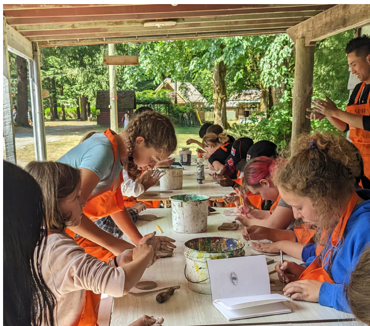
Bringing the studio outdoors at Paradise Valley Camp!

Ninety-seven young artists enjoyed outdoor studio adventures with teams of experienced art teachers and one of Canada's finest artists. Campers received in-depth instruction in sculpture, collage, drawing, painting and printmaking, and took part in canoeing, hiking, cave exploration, campfire singalongs and a variety of fun filled outdoor games.