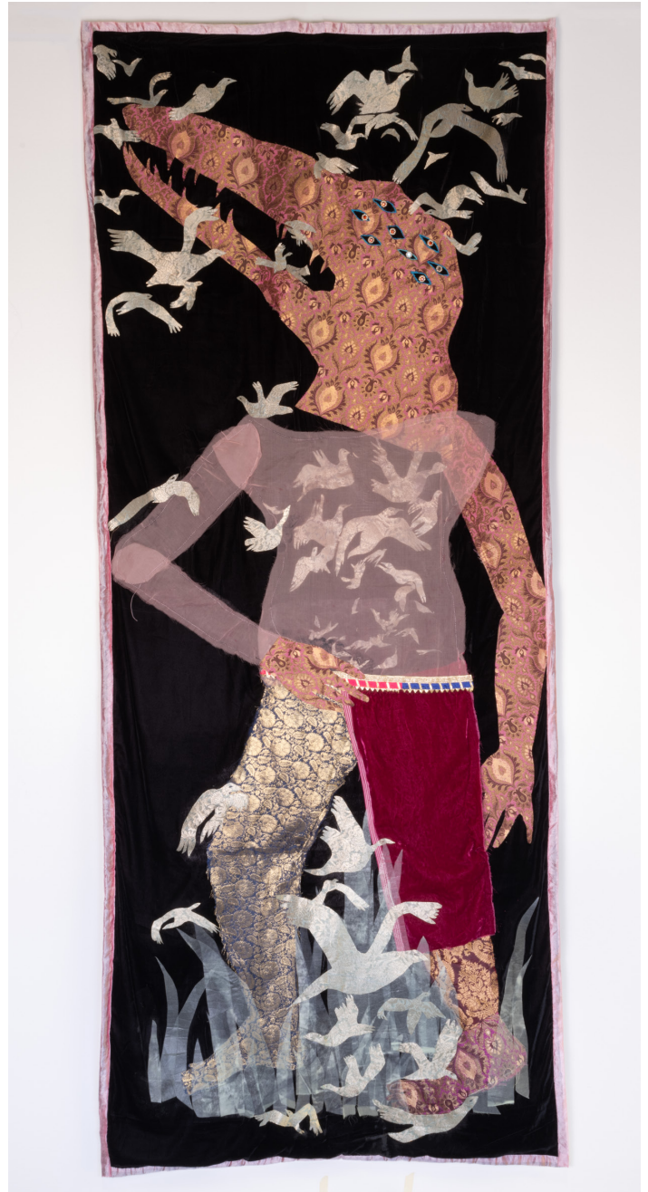
Sara Khan , Renegade Mothers: Crocodile Breath , 2023, Textile: buttons, fabric, thread and fabric glue, 96" x 36" Acquired with the Artists for Kids' Acquisition Fund