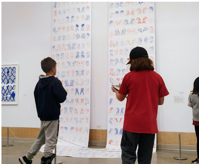
Grade 5 students visiting the Gordon Smith Gallery and experiencing the Art of Conversation exhibition.