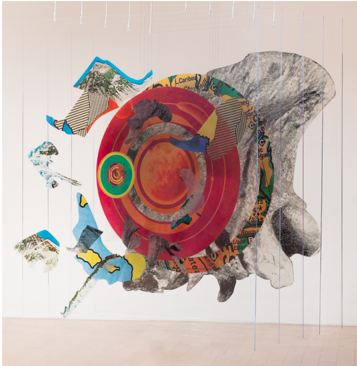
Anna Binta Diallo , A forecast of pastures, bluffs and bones , 2023 digital collage on multilayered plexiglass, 5 ft x 5 ft, 5 panels Acquired with the Artists for Kids' Acquisition Fund