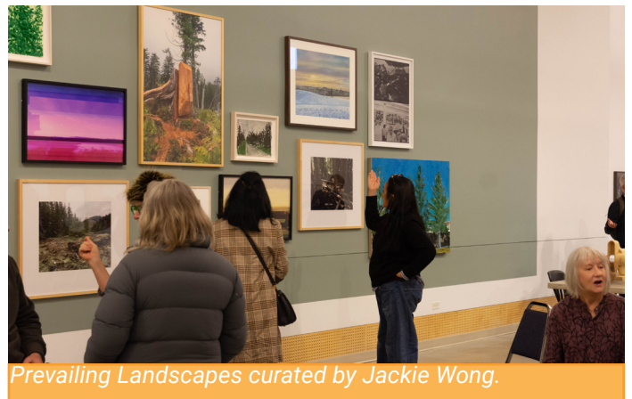
Prevailing Landscapes curated by Jackie Wong.