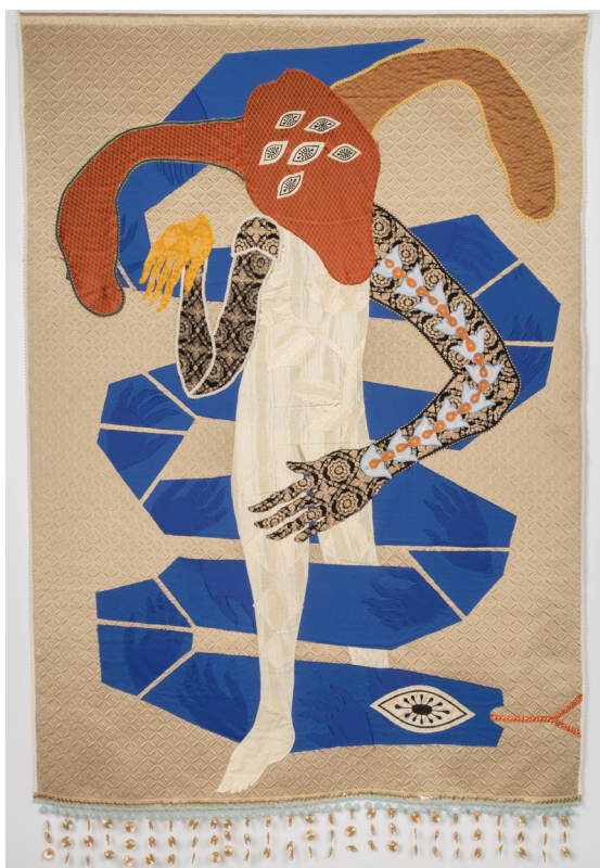
Sandeep Johal , Horns of Power (Uterus Woman) , 202, Textile 84" x 56" Acquired with the Artists for Kids' Acquisition Fund