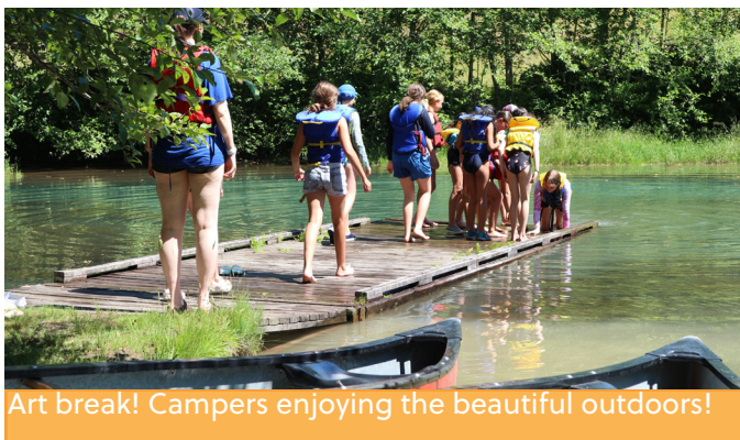
Art break! Campers enjoying the beautiful outdoors!