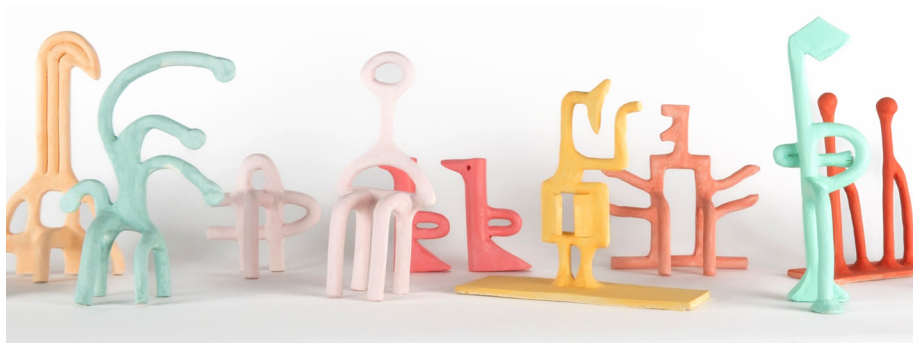
Parvin Peivandi , Utopian Rug , 2023 ceramic figures, glaze and acrylic paint 121.92 x 91.44 cm Acquired with the Artists for Kids' Acquisition Fund