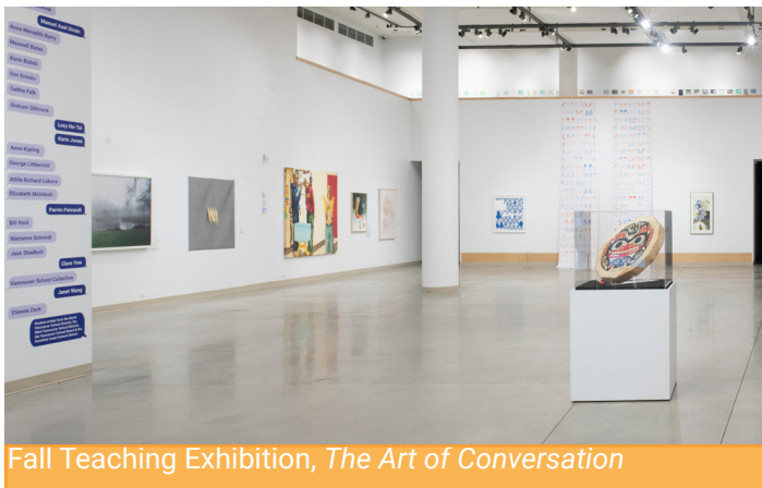
Fall Teaching Exhibition, The Art of Conversation

We acknowledge the support of the Canada Council for the Arts.