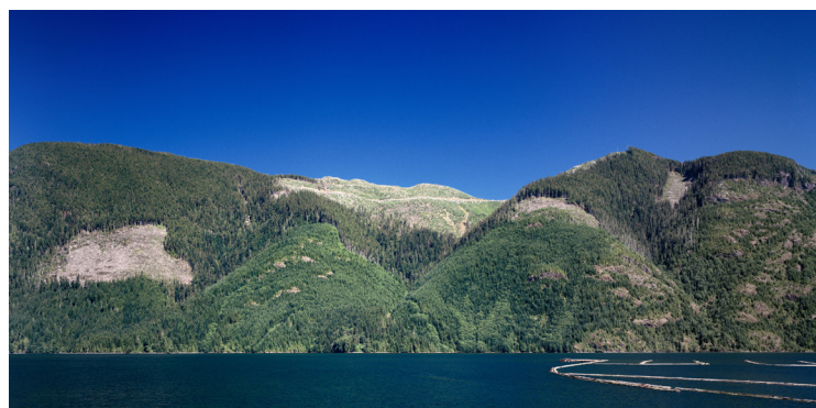
Stan Douglas , View of Clearcuts from Blowhole Bay (25 of 30) , 1996, chromogenic print, 18 x 36 inches Gift of the artist

We gratefully acknowledge The Christopher Foundation and the Tuey Charitable Foundation for their support of the Artists for Kids' Acquisition Fund.