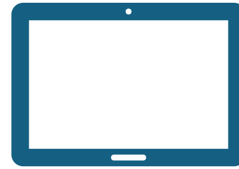
Tablet with keyboard