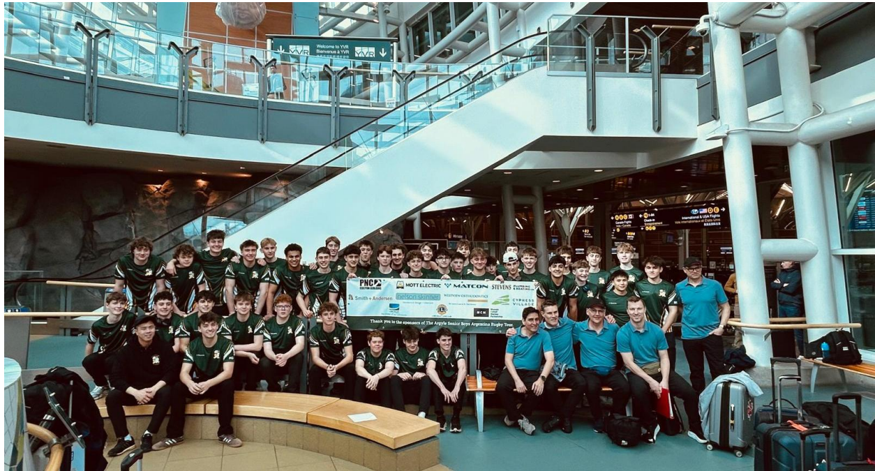
Argyle Senior Boys Rugby Travels to Argentina over Spring Break