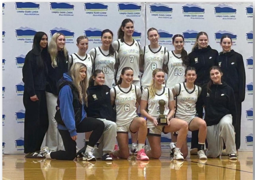
Sr. Girls Basketball wins Tsumaura Tournament Dec 15, 2025

Argyle will be hosting many home games and meets in the new year, check out our home game schedule here!