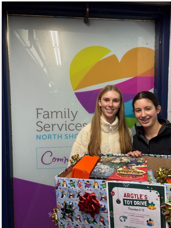
Dropping off book donations from the library's December book drive at the Christmas Bureau – thank you for your donations!