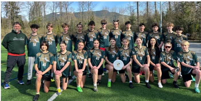
Argyle Junior Ultimate Team – NSSAA Champions!

Argyle Junior Ultimate team finished in first place in the NSSAA Championships!