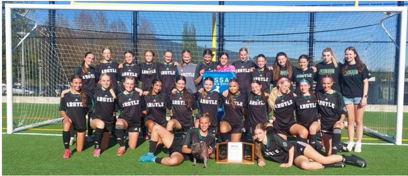
Argyle Senior Girls Soccer Team – North Shore Champions!

The Argyle Senior Girls have been undefeated in early season tournaments and have won the North Shore Championship. The team has advanced to the Vancouver Sea to Sky semi-final, hoping to qualify for the BC Provincial Championship later in the season.