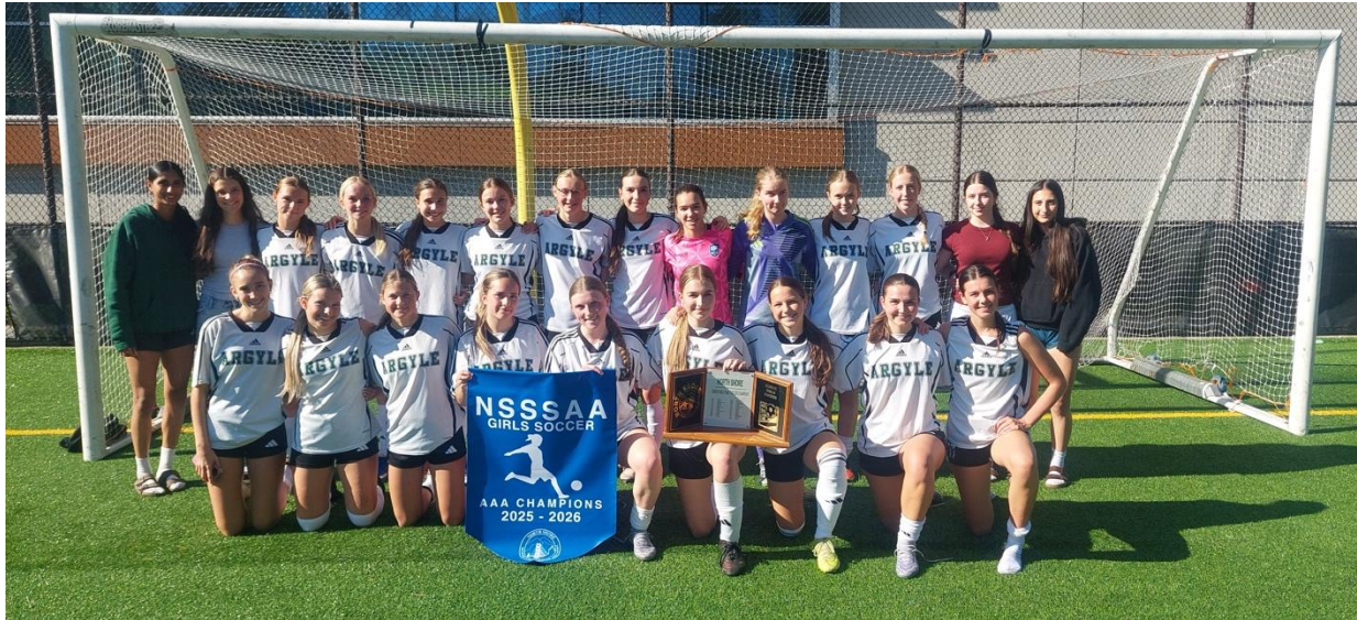
Sr. Girls Soccer wins North Shore Championship April 2026