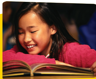
North Vancouver School District Service Delivery Model of Support