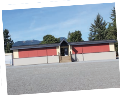
New Ridgeway Elementary modular.

"There is a great sense of community in our school. The staff, students, and parents are all great to work with and I am pleased to be part of such a great community," says Yeo.