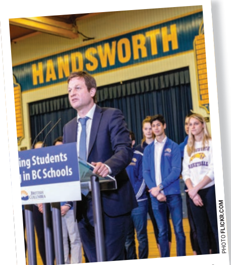
Minister of Education, Rob Fleming, announces $62.3M funding of Handsworth Rebuild.

The project will provide a seismically safe and state-of-the-art school, designed to accommodate more students. The new school will be built on the west side of the current property. The current school will remain open until the new school is finished and then the old building will be replaced with a new grass field.