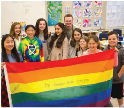
"The Pride flag was also raised on the flagpole alongside the Canadian flag."

On May 19, 2017, International Anti-Homophobia Day, Cleveland demonstrated its commitment to being a safe and caring school by inviting students to wear clothing of various rainbow colours to show their support. The Pride flag