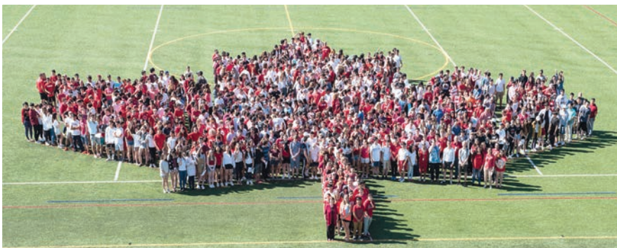
Summer Learning celebrates Canada's 150th, Summer 2017