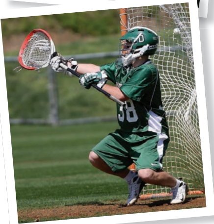
"In addition to developing skills, the lacrosse academy will also honour the history and culture of the Squamish Nation, whose members have been heavily involved in lacrosse for many generations"