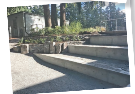
Capilano's new accessible outdoor learning space.