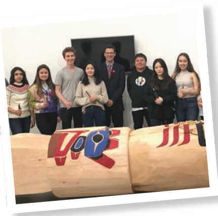
"Students understand that they are a valued stakeholder and their thoughts and voice can make a difference."

"This world is but a canvas to our imagination." HENRY DAVID THOREAU