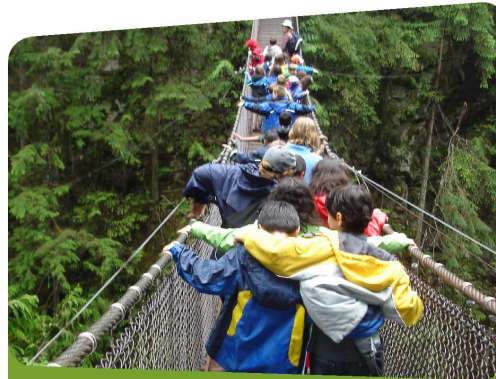
North Vancouver School District 2011–2021 Strategic Plan