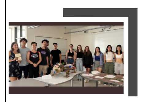
Celebration of Learning Open House Theme: "Me as a Learner"