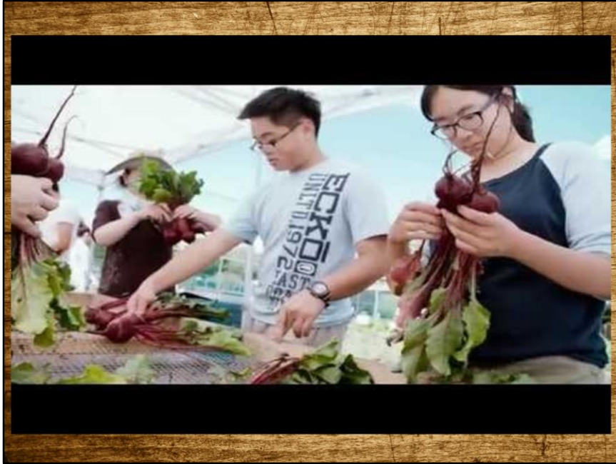
Farm to School Vancouver Area video: farmtoschoolbc.ca