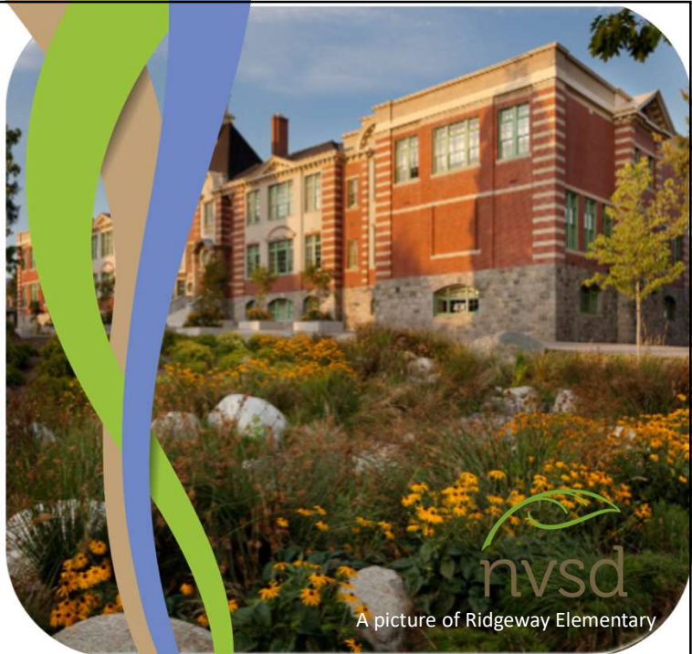
A picture of Ridgeway Elementary