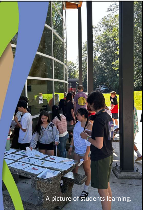
A picture of students learning.