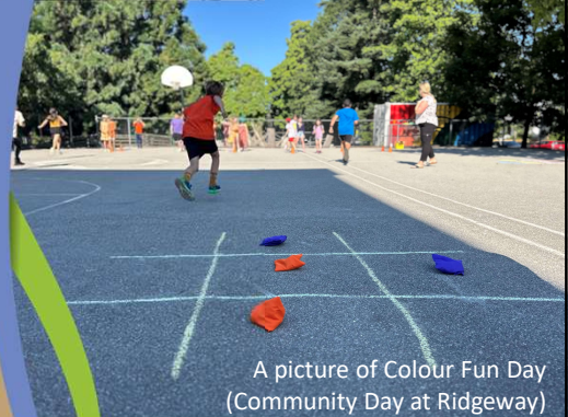
A picture of Colour Fun Day (Community Day at Ridgeway)