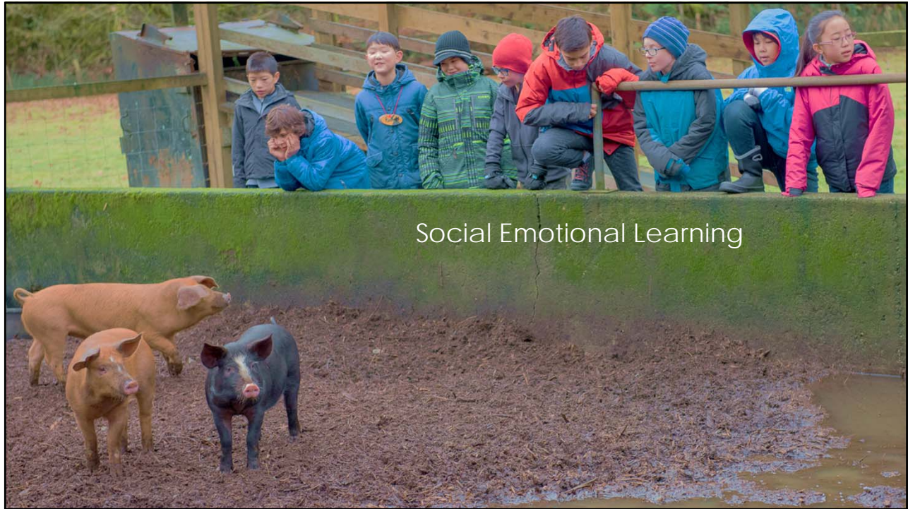
Social Emotional Learning