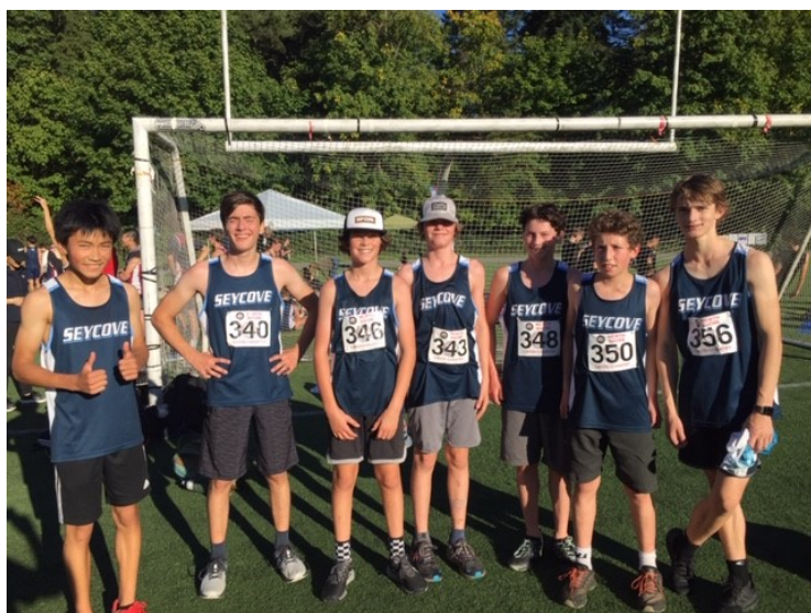
Seyhawks Junior Boys Cross Country team post (above)