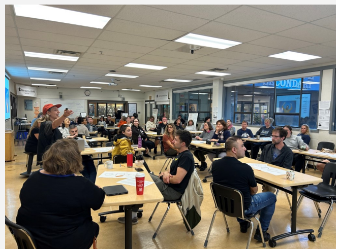
Seycove Staff sharing and learning at the recent Staff Collaboration Session