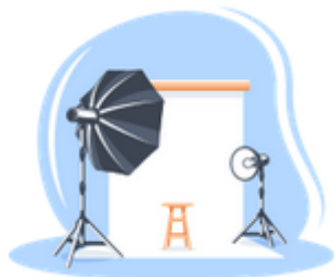
Photo Retake Day - Tuesday October 18

Students who have not yet been photographed, must get their photos taken.