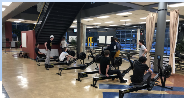
Rowing Academy Students—dryland training on ergometers