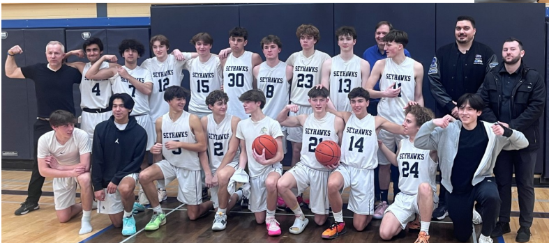
Senior Boys Basketball Team all set to take on Sutherland