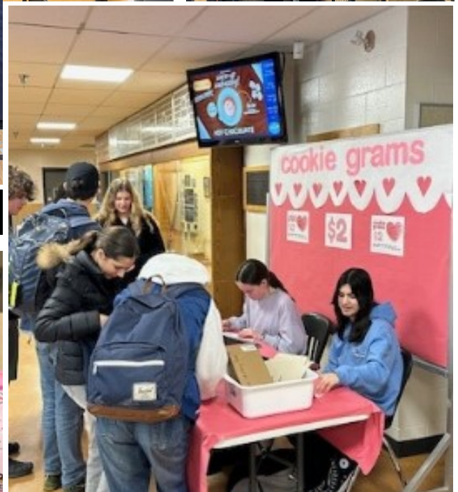
Students deciding who will get a cookie-gram for Valentine's Day