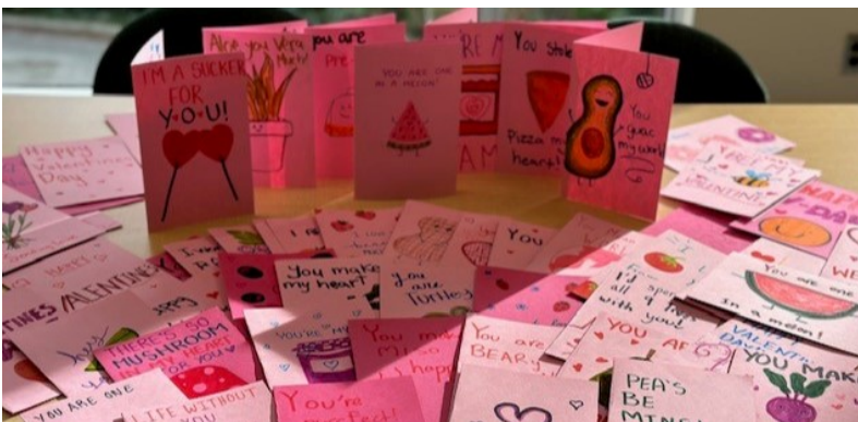
Some of the cards students have worked on to share with our senior neighbours at Cedar Springs