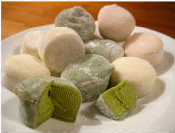
Mochi ice cream in green tea, vanilla, and strawberry flavors