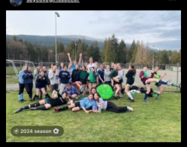
♥ Q ♥ ♥ □ SeyCovepiritssoccer Super excited for this season! Stay tuned for game dates after the break everyone!