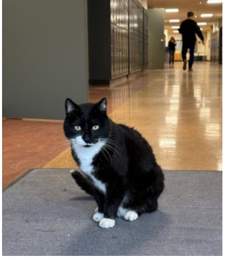
The neighbourhood cat has purr-fect attendance when the back door is left open.

Written by over 20 000 participants worldwide every year, the Euclid contest gives senior-level secondary school students the opportunity to tackle novel problems with creativity and all of the knowledge they've gained in secondary school mathematics.