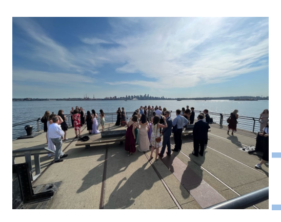
Congratulations Class of 2023