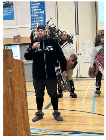
Celebrating Indigenous Student Talent and Culture on National Indigenous Peoples Day