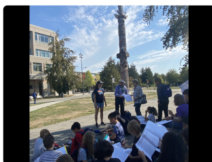
Pics of that