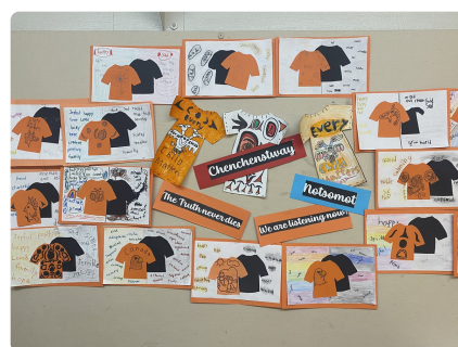
Pics of this