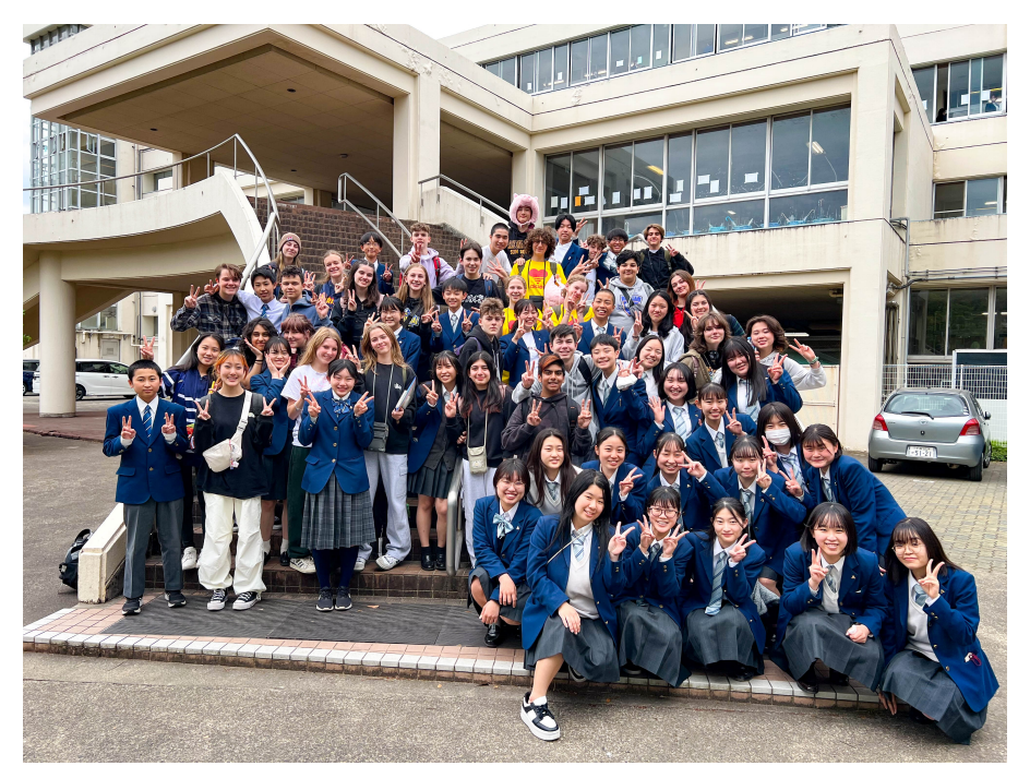
Group photo from the 2022-23 Trip

Follow their adventures on the trip blog at https://handsworthjapan2024.wordpress.com