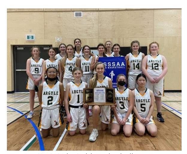
Gr. 8 Girls Gold Basketball Team