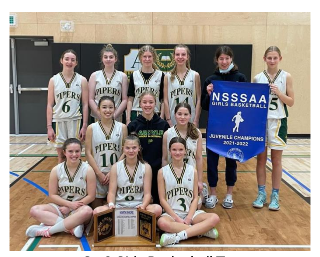
Gr. 9 Girls Basketball Team