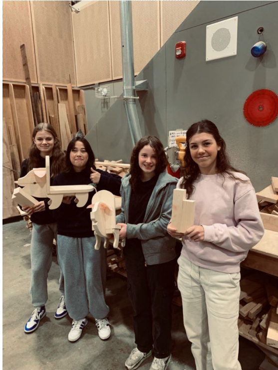
Students in woodwork with their Christmas gift creations