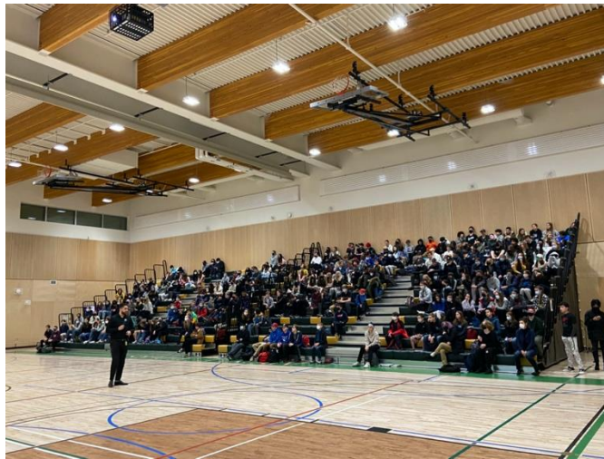
Gr 8 students in today's online safety assembly

To register for the May 24 virtual session, click HERE .