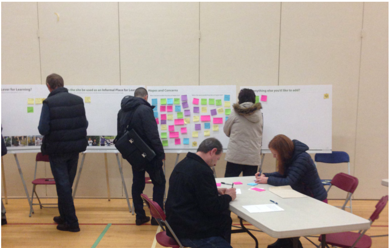
Lucas Open House