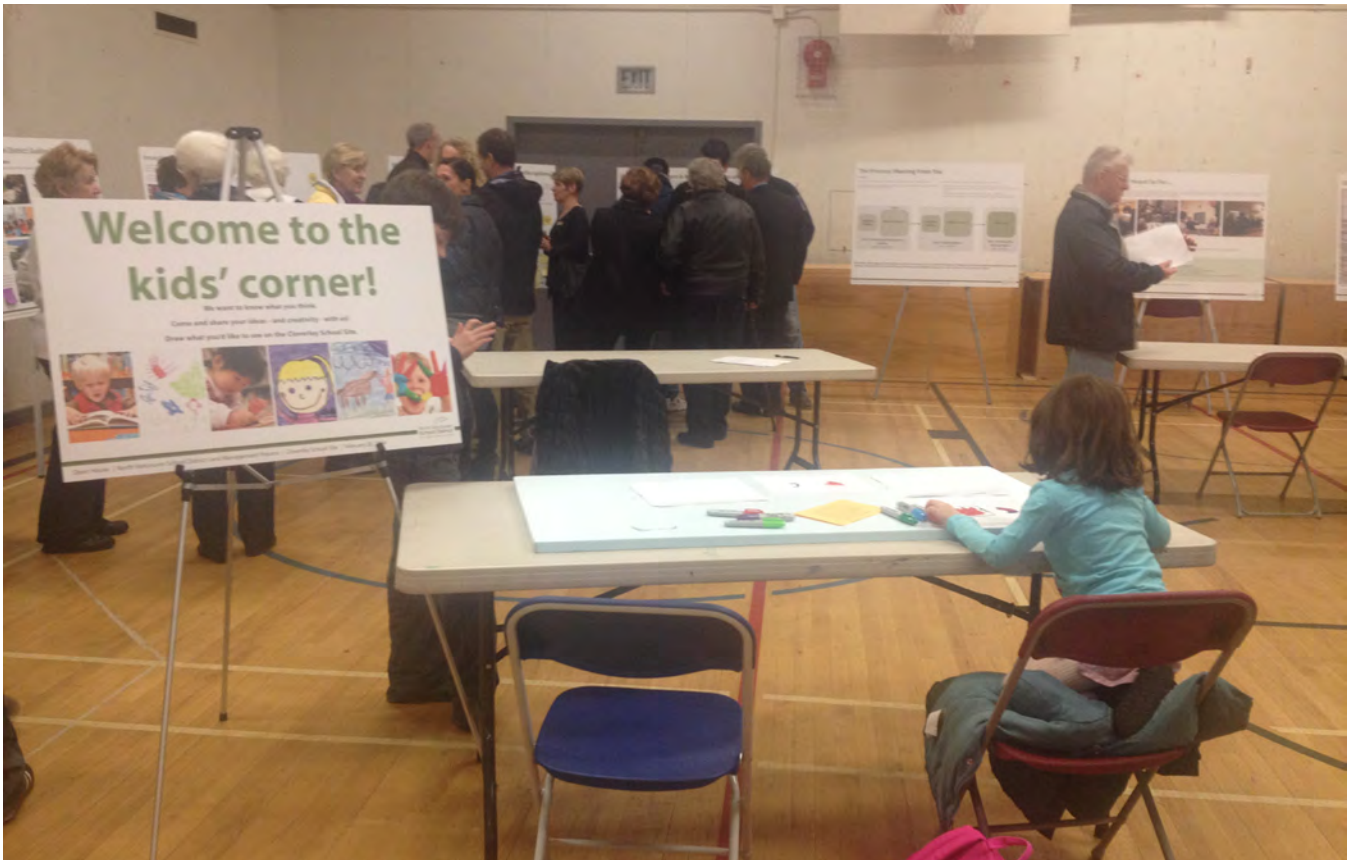
Cloverley Open House