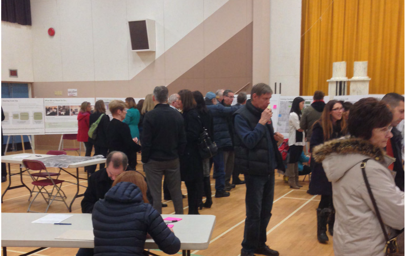
Lucas Open House