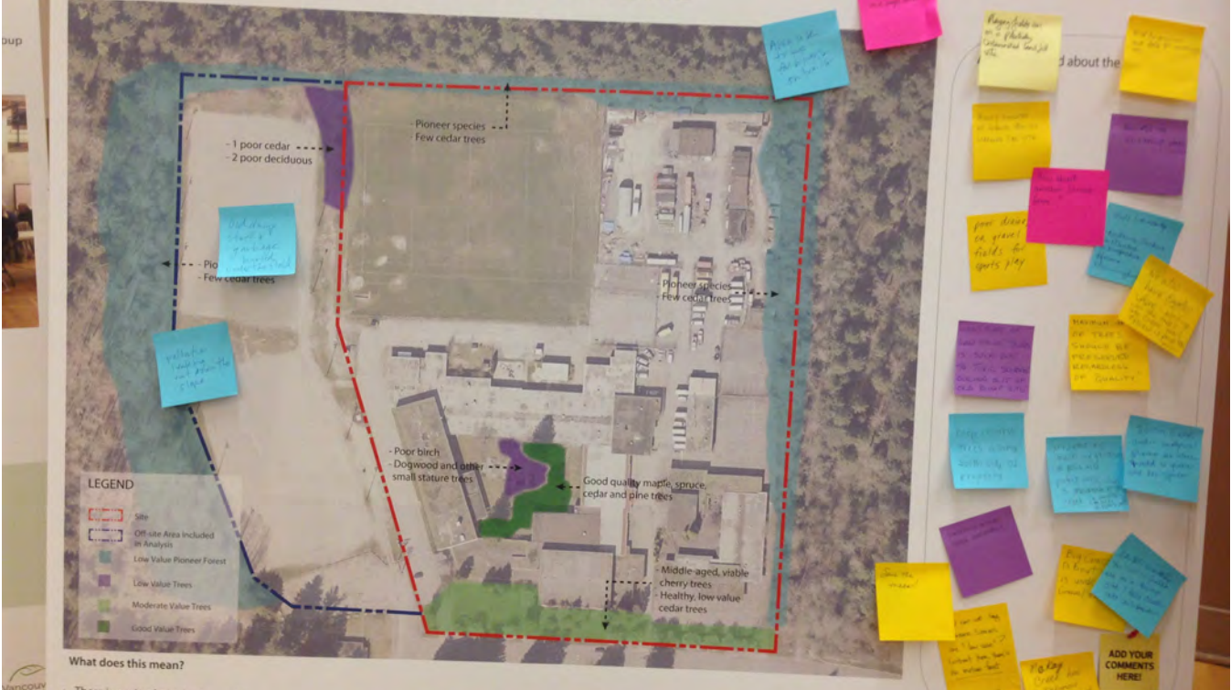
Lucas Open House