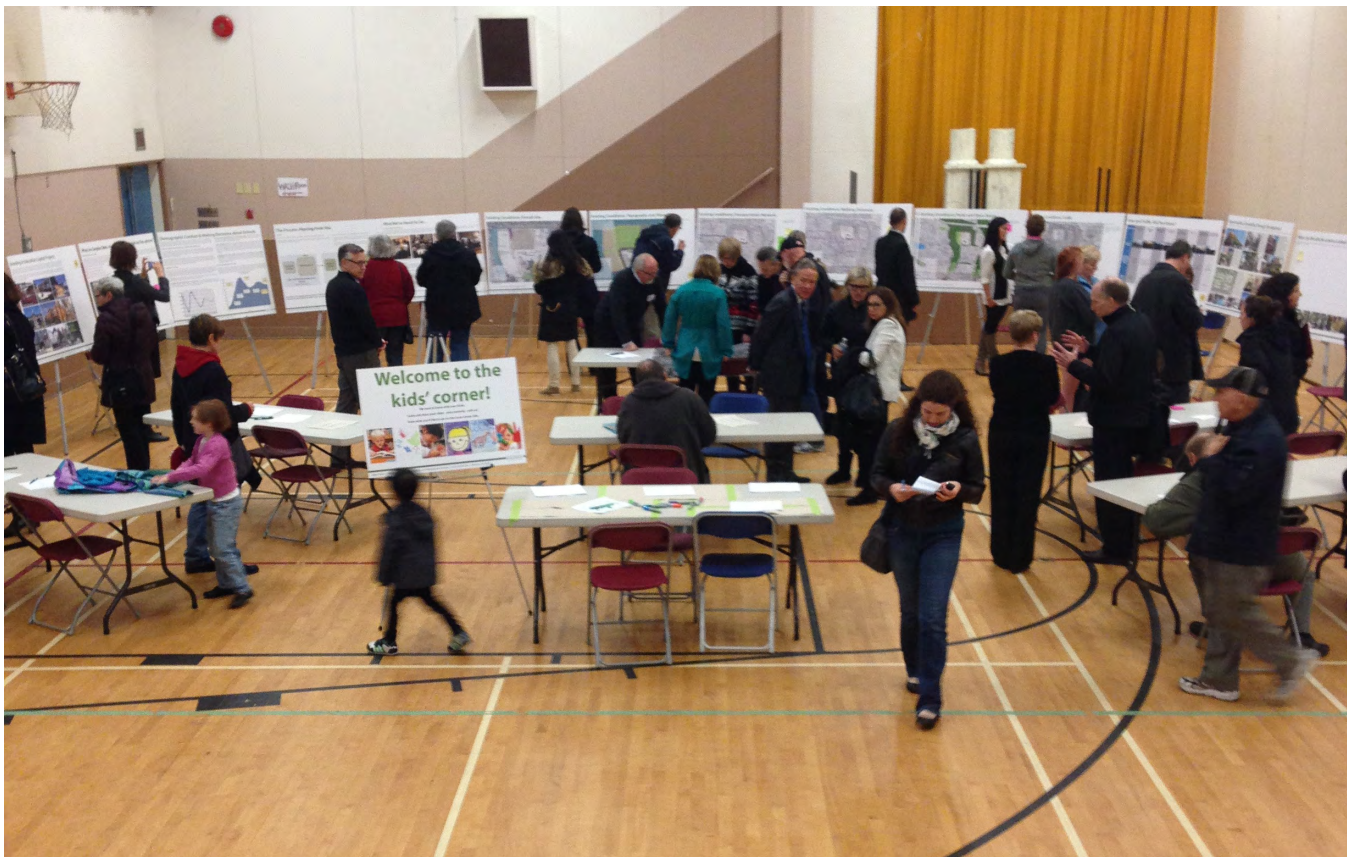
Lucas Open House