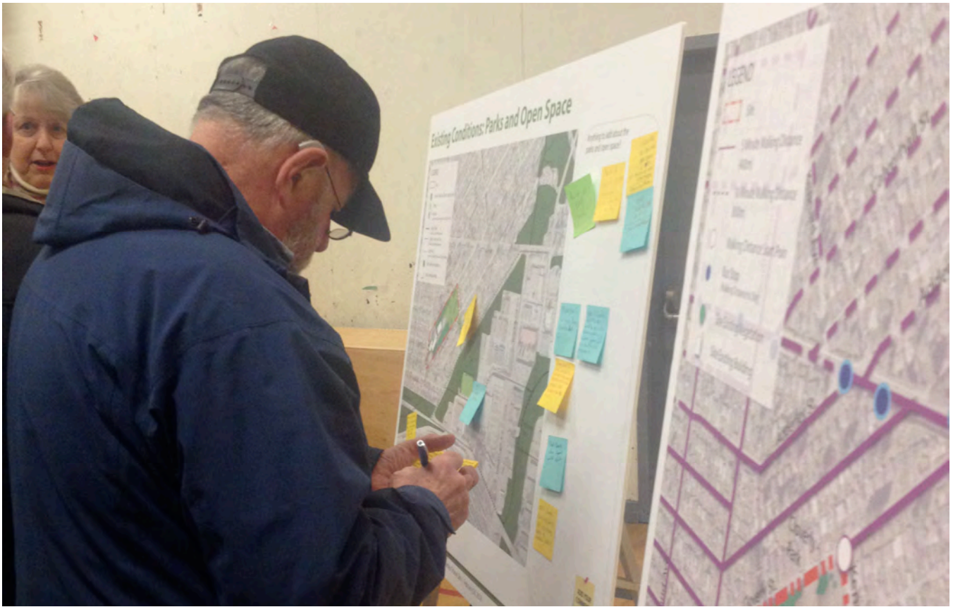
Cloverley Open House