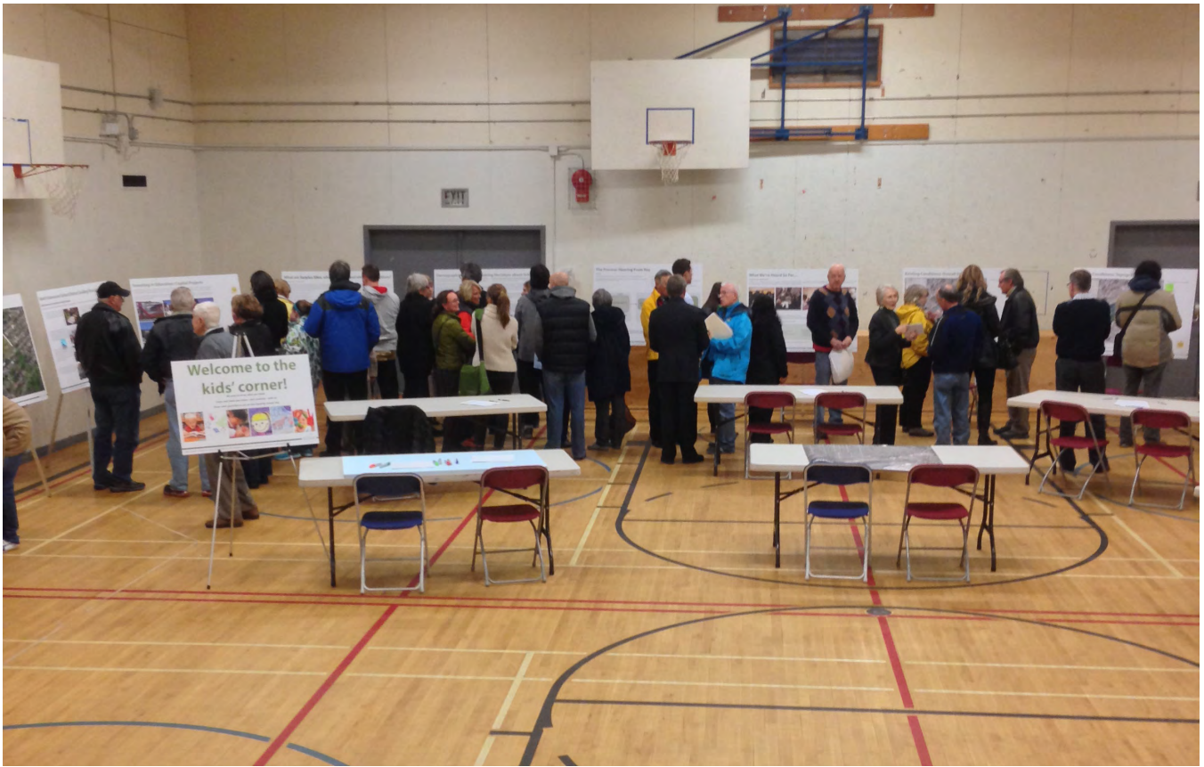
Cloverley Open House